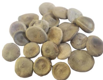
Figure 1. Seeds of Strychnos Nuxvomica