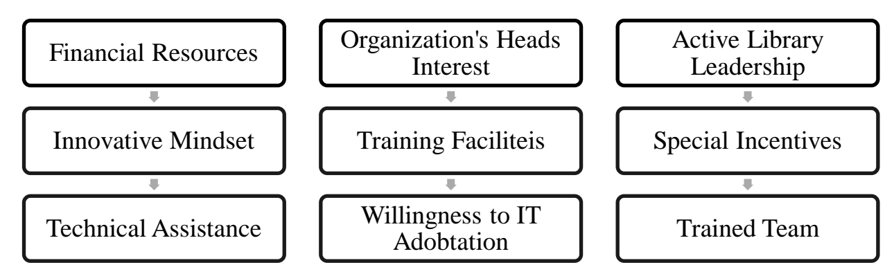
Figure-1: Major Factors Leading towards Technology-Adoption

Following Figure 8.0 reveals major factors that assist in technology adoption in university libraries: